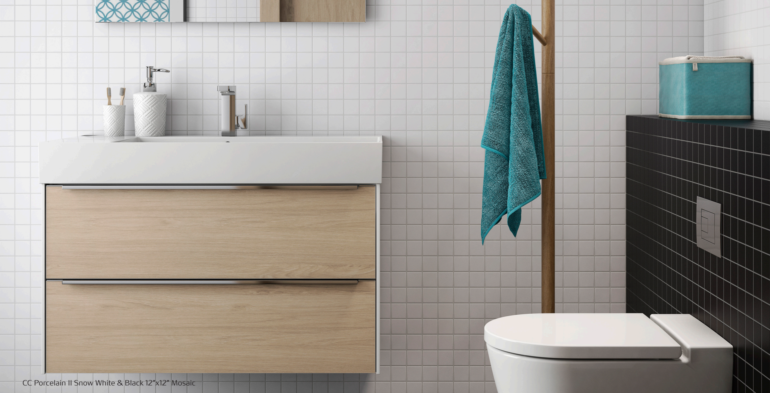
CC Porcelain II Snow White & Black 12"x12" Mosaic