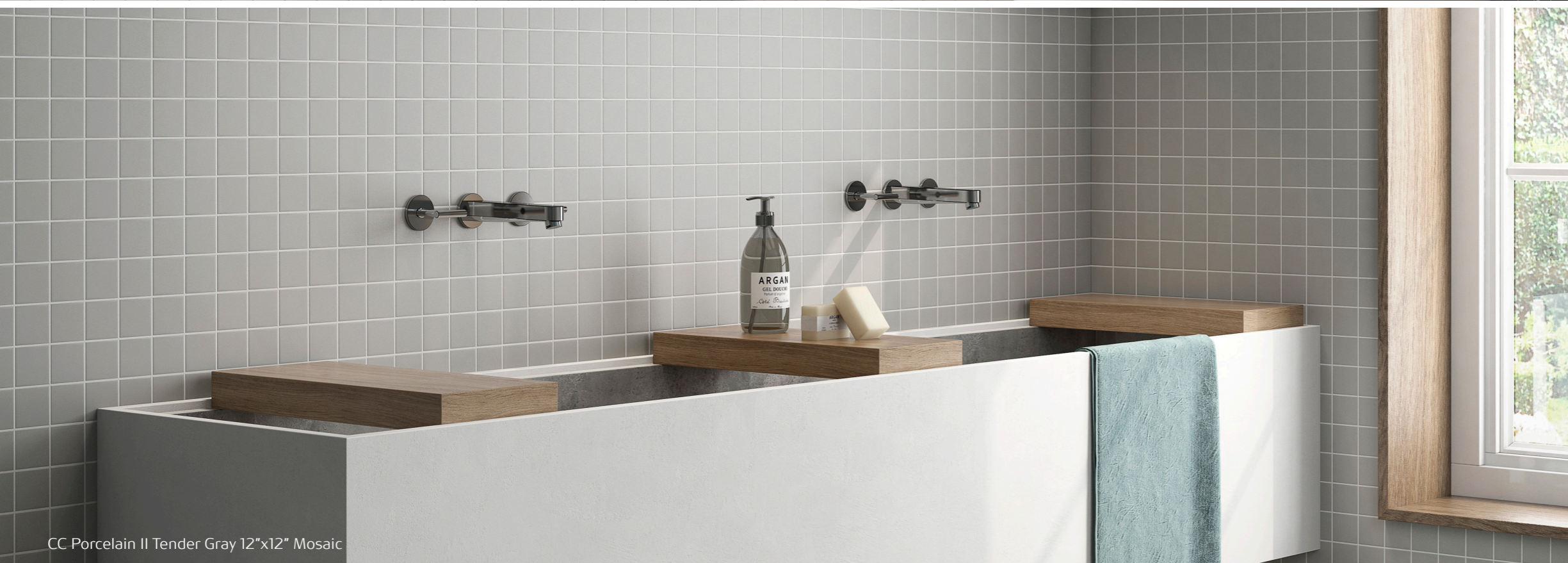
CC Porcelain II Tender Gray 12"x12" Mosaic