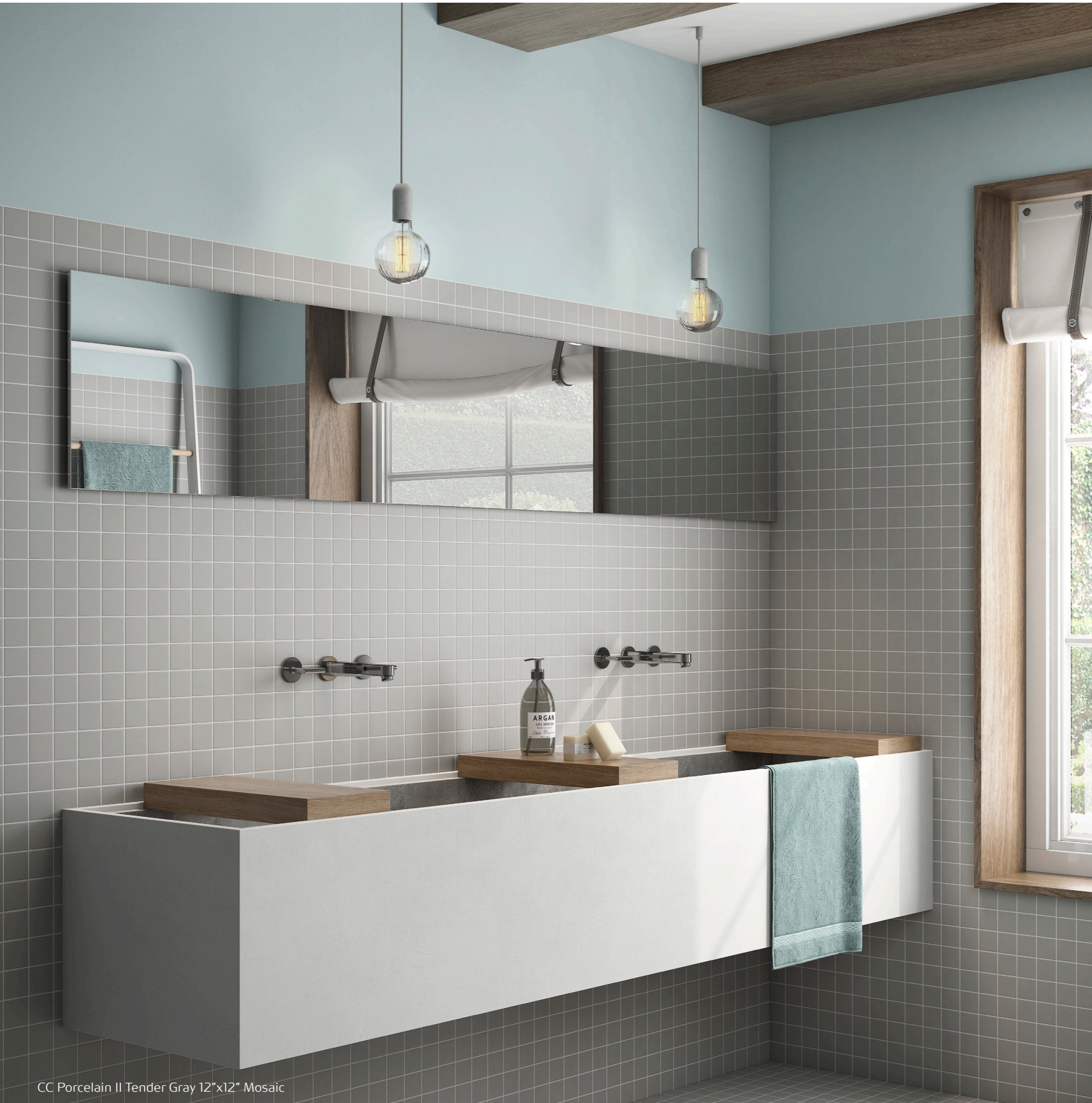
CC Porcelain II Tender Gray 12"x12" Mosaic

CC Porcelain II is a sober unglazed porcelain mosaic. Available in 4 neutral tones, which can be used in both commercial and residential projects.