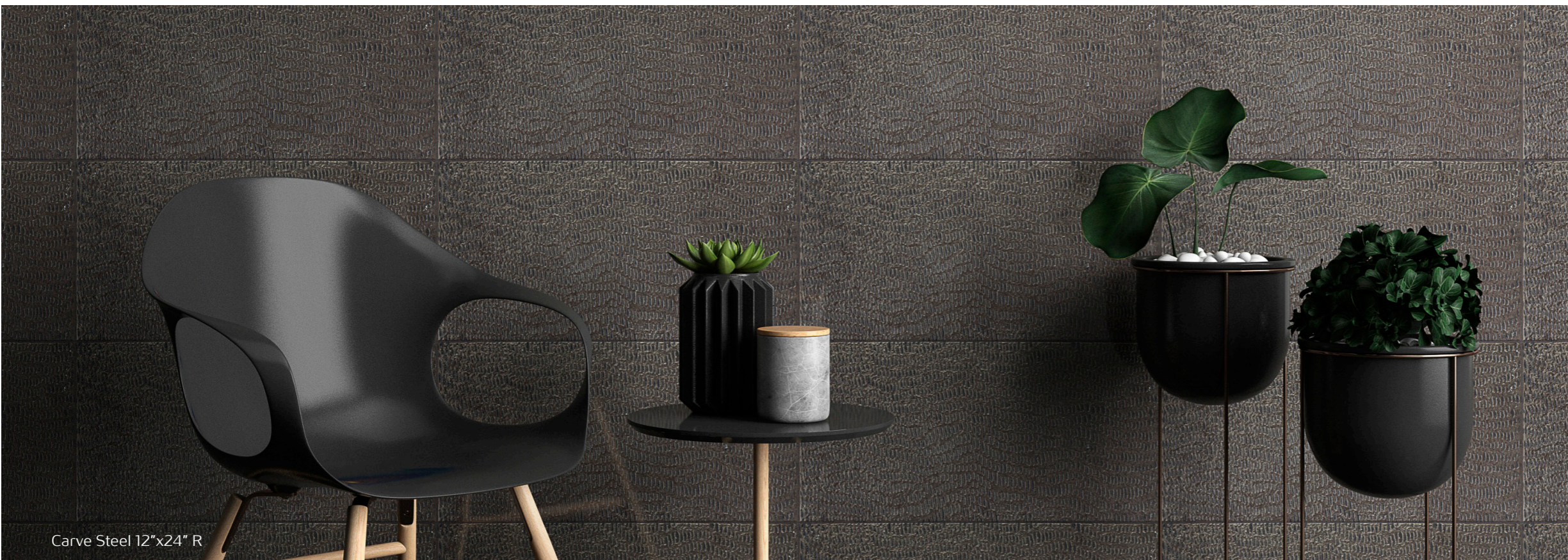
Carve Steel 12"x24" R