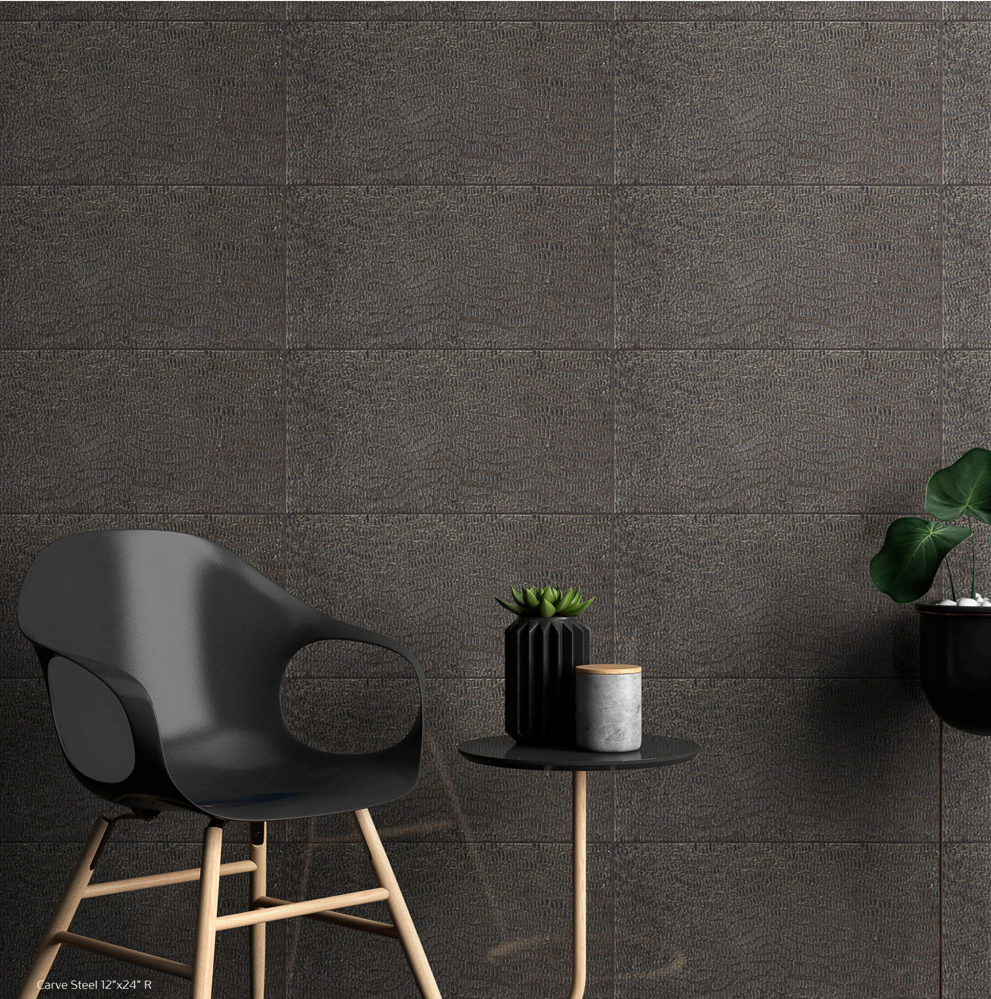
Carve Steel 12"x24" R

Add texture and character to your spaces with our Carve series, presenting a soft carved finish on top of a steel color that will remind you of a piece of art.