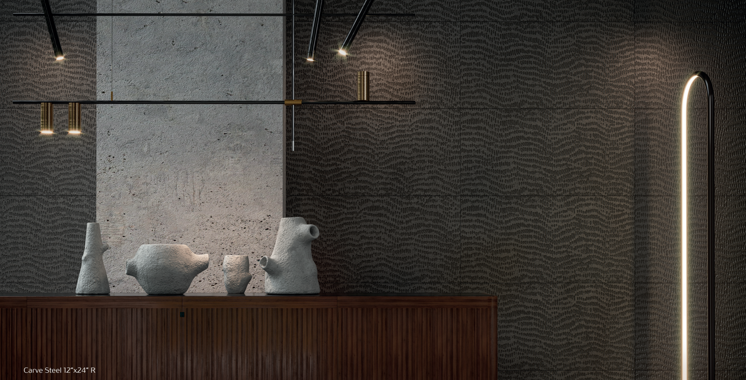
Carve Steel 12"x24" R