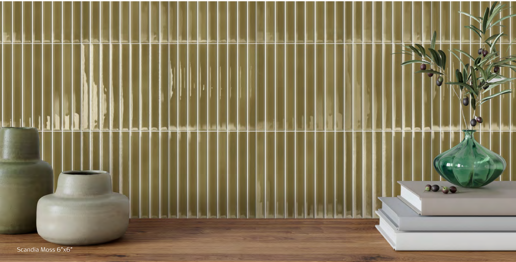
Scandia Moss 6"x6"

Inspired by Nordic simplicity, Scandia brings texture and tranquility to the surface. Its refined 3D kit-kat design creates a rhythmic, linear pattern that adds depth and subtle shadow play to any wall. The palette evokes calm skies, natural landscapes, and clean architectural spaces. The dimensional format enhances light and movement, transforming simple walls into tactile, modern statements. Scandia is where minimalism meets texture – fresh, structured, and effortlessly contemporary.