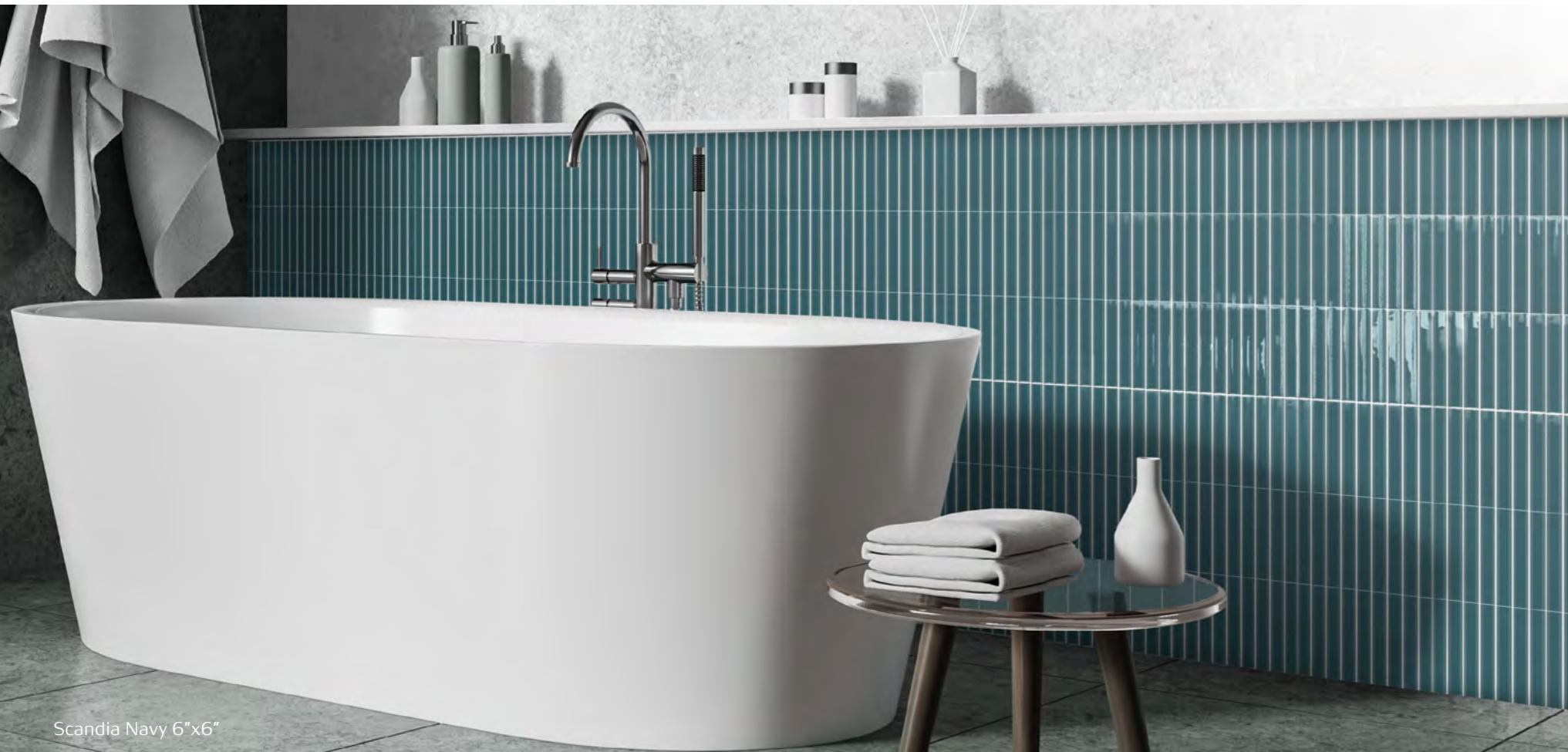
Scandia Navy 6"x6"